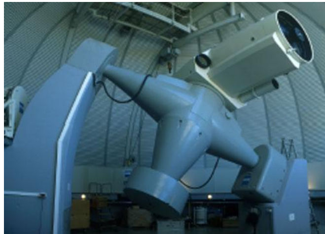
Fig. 5: ESA Space Debris Telescope, Tenerife, Spain [14]

Optical telescopes form the second major type of sensor used to track space objects. They operate in the same fashion as telescopes used for astronomy applications: electromagnetic radiation emitted by an object is gathered and focused to form an image. Refracting telescopes use lenses, while reflecting telescopes use mirrors. Catadioptric telescopes used a combination of mirrors and lenses. Although telescopes can be designed for many different parts of the EM spectrum, the visible portion is most often used for SSA. Fig. 5 shows the European Space Agency's (ESA) Space Debris Telescope, located on the island of Tenerife, Spain.