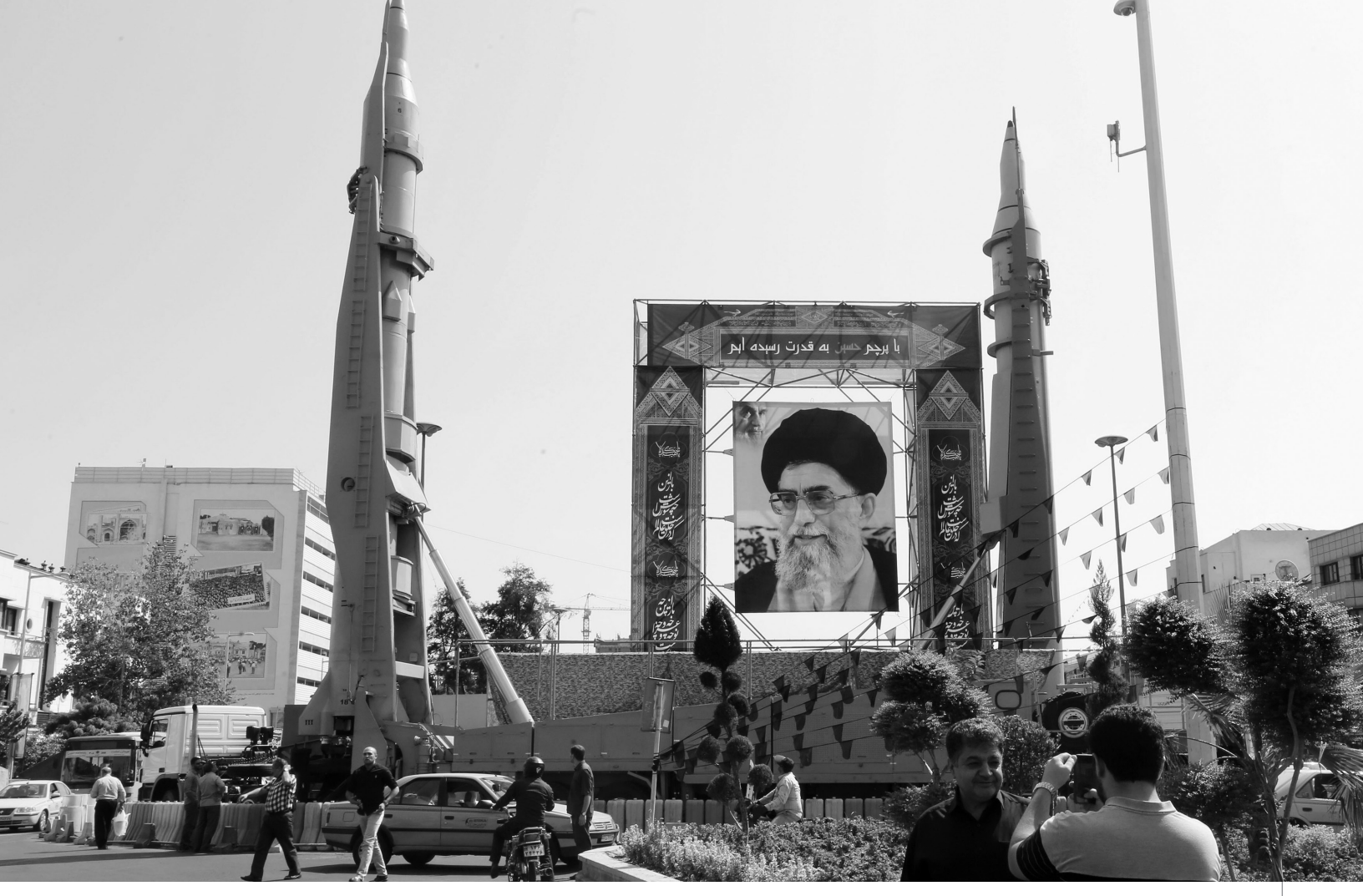
Iranian Sejjil (left) and Ghadr-H medium-range ballistic missiles are displayed in Tehran September 25, 2017 next to a portrait of Supreme Leader Ayatollah Ali Khamenei during annual defense-week events.

motivations to deploy new nuclear weapon systems to penetrate or evade U.S. missile defenses, in turn motivating Russia to help persuade Iran to accept restraints on its missile program.