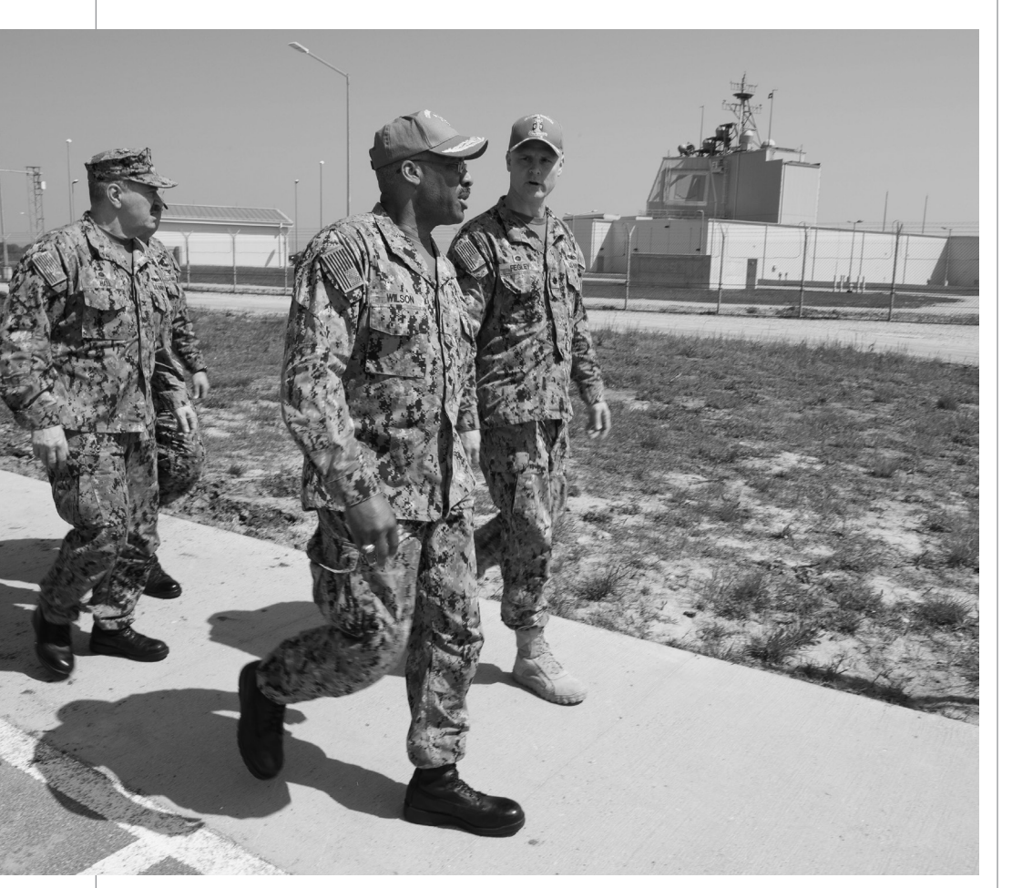
U.S. Rear Adm. Jesse Wilson, Jr. (center), commander of Naval Surface Force Atlantic, tours the Aegis Ashore facility at Deveselu, Romania, on April 14. The complex is part of the European Phased Adaptive Approach (EPAA) missile defense system to counter the Iranian ballistic missile threat.

For more than a decade, U.S. presidents have invested considerable capital in pursuing missile defenses against Iranian missiles with ranges exceeding 2,000 kilometers. Justifying the development of a European missile defense architecture in 2007, President George W. Bush argued that "the need for missile defense in Europe is real and I believe it's urgent.